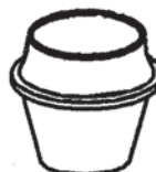
CA-9047 LARGE CERAMIC CRUCIBLE pkg/5